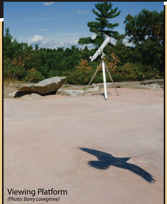
Viewing Platform

For viewing conditions & event details visit: