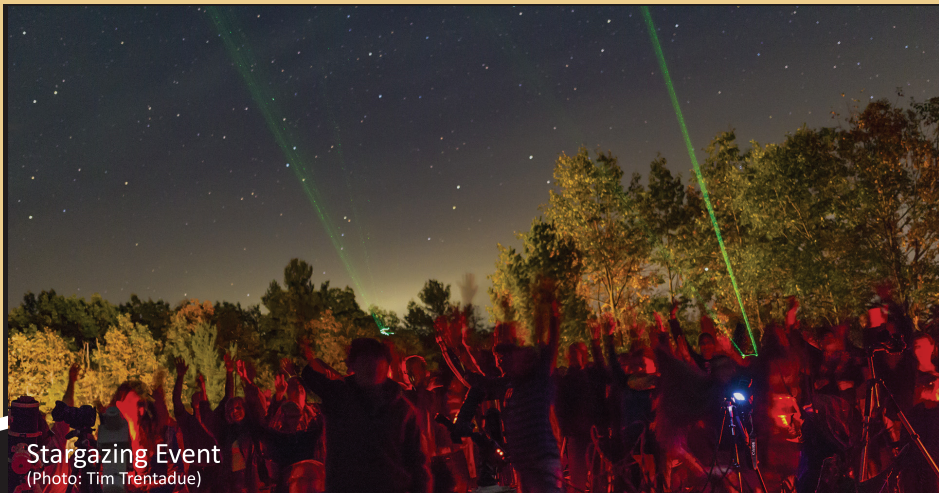
Stargazing Event

The DSVA is open year-round and there is no admission charge. Visitors are invited to bring along a lawn chair and binoculars or a telescope to view the night sky as it was meant to be seen.